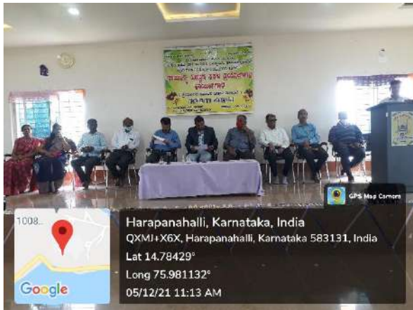
Harapanahalli, Karnataka, India QXMJ+X6X, Harapanahalli, Karnataka 583131, India Lat 14.78429° Long 75.981132° 05/12/21 11:13 AM