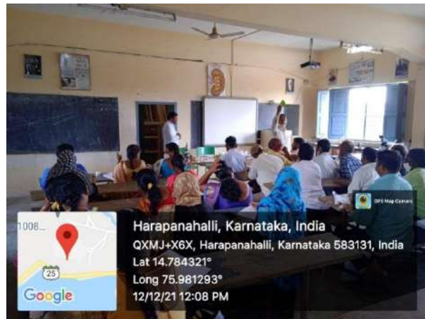
Harapanahalli, Karnataka, India QXMJ+X6X, Harapanahalli, Karnataka 583131, India Lat 14.784321° Long 75.981293° 12/12/21 12:08 PM