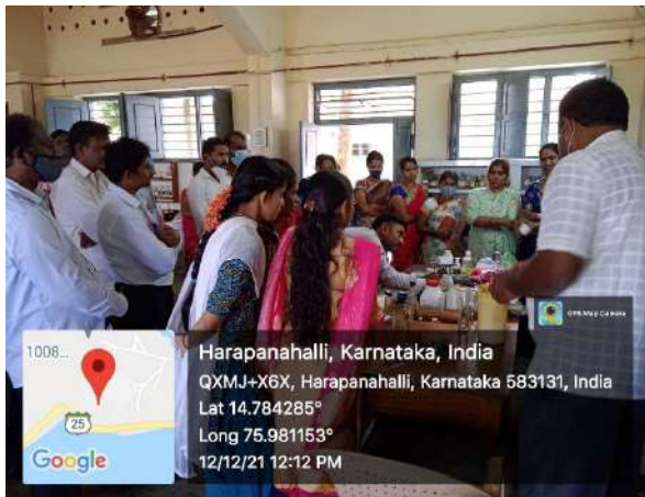
Harapanahalli, Karnataka, India QXMJ+X6X, Harapanahalli, Karnataka 583131, India Lat 14.784285° Long 75.981153° 12/12/21 12:12 PM